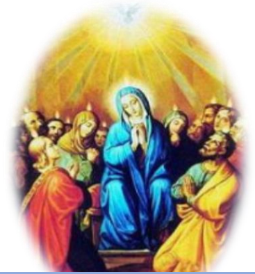
Our Lady Queen of the Apostles

Scripture - May the God of hope fill you with all joy and peace in believing, so that you may abound in hope by the power of the Holy Spirit. Rms. 15:13